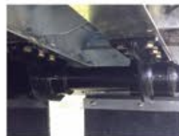
Double hinge shoes