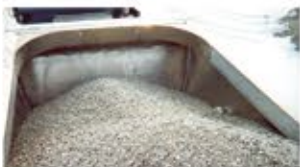
Large radius gussets on bulkhead