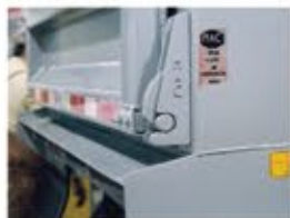
Steel gate latches