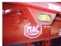
Totally enclosed wiring