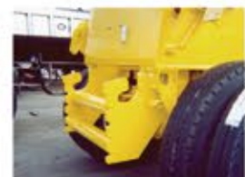
Push bumper/tow hooks