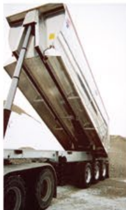
Full length rubber on longitudinals

28' Quad Axle with 66" sides with full length bolt on fenders