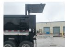
High lift gate