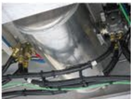
Aluminum 12" Jumbo Air Tanks