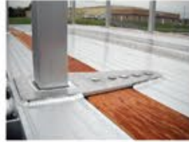
Deck Pockets Along Side Rail