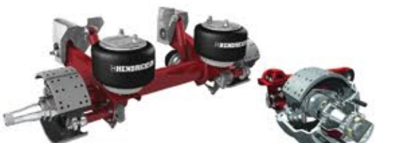
JOST AX150 Aluminum Outer Leg Landing Gear