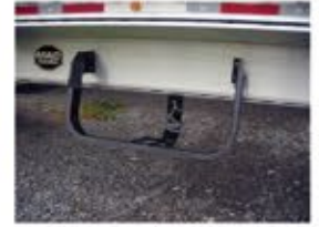
Tire Carrier Option