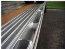
Single Spool Side Rail Option