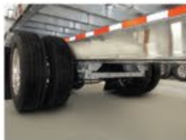
AANL-230 w/ 250 air bags and Hendrickson HXL-5 sealed Wheel End System (5-yr. Warranty). Galvanized suspension hangers and brace.