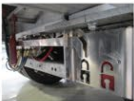
Slider Latching Mechanism with Extended Arm