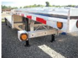
Wide Load Retractable Lights - Full Extension