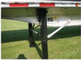
Aluminum Dolly Bracing