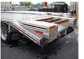
Beaver Tail with Flip Ramp and Deck Boards