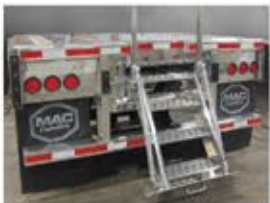
MAC STEP-UP Ready for Use with 2-handle Positions