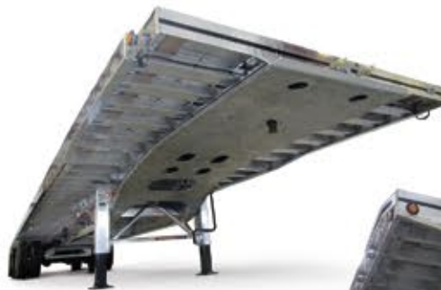
MLP-6 1/2" Aluminum Coupler Plate extending through the neck transition.