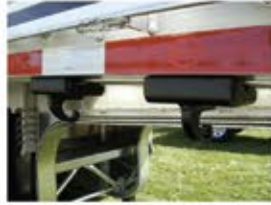
Slide Strap Hooks