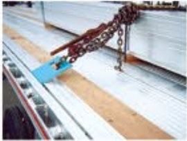
Sliding J-Hook Tie Down