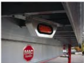
Enclosed Midturn Light Option