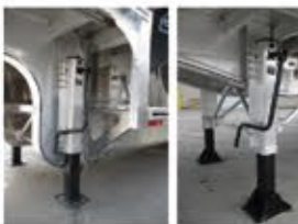
Hendrickson RTR Intraxx Suspension with HXL5, Full 5-yr. warranty.