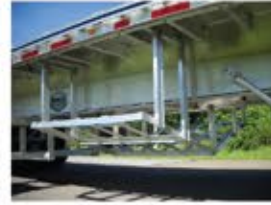
Belly Mount Panel Storage Rack