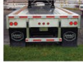
ICC Bumper 48" Length and Under