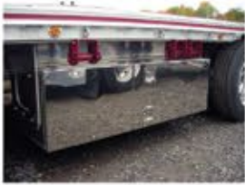
60" Double Door Toolbox, Sliding Winches & Rope Hooks