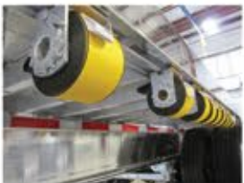
Galvanized sliding winch option