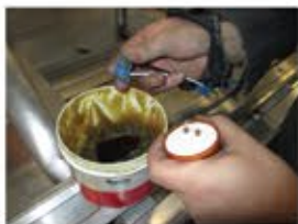
Extra Di-Electric Grease Added