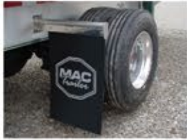
Frame Bolt Mount Flap Bracket