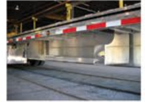
Dunnage Box-Side Mount