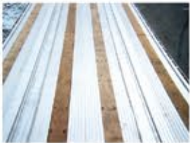
Drop Deck with Four Nailers