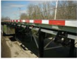
Western Side Rail with Fixed Angle Winches and Fixed Strap Hooks