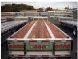
Apitong Wooden Deck Option with Container Locks