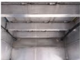
MAC's Integrally Superior Welded Design