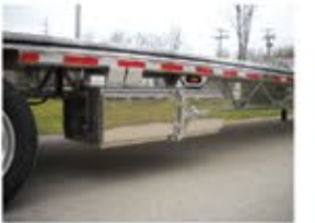
60" Double Door Toolbox with Stainless Steel Camlock