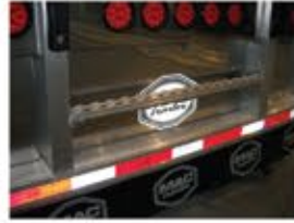
Bumper-Center Section Full Width Step