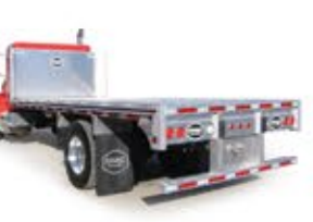
Straight Truck Bed Available