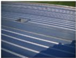
Deck Slitter Pockets