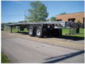
Single Axle Slider moved to Cal. Legal