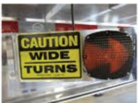
Wide Turn directional arrow on each side