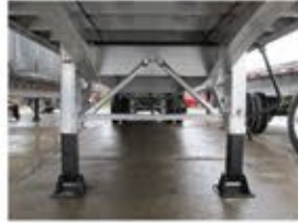
Flatbed Landing Gear K-bracing