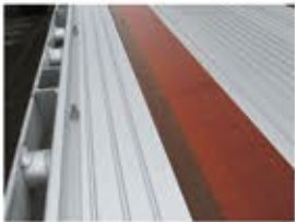
Double Entry J-track with Double Spools